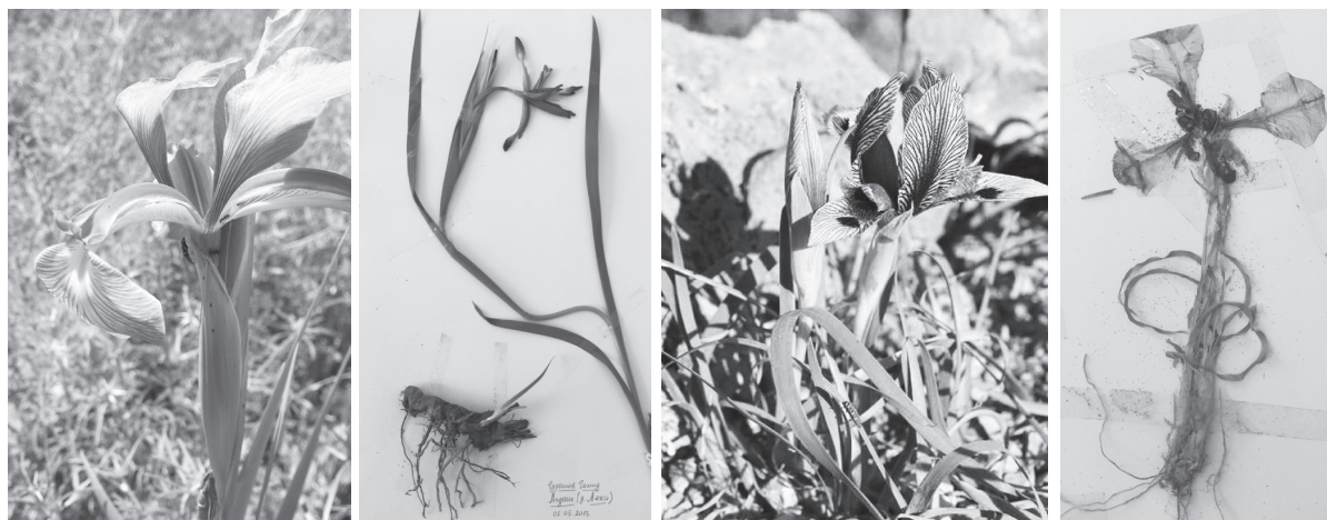
I. carthalinae Fomin

The analysis of the methyl ethers of carboxylic acids was carried out by the method of chromatography-mass-spectrometry 25–27 ) on a 5973N/6890N MSD/DS