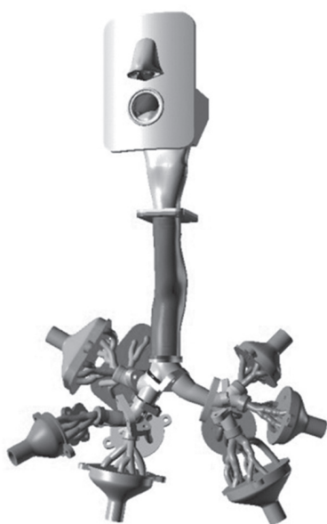
Fig. 1. Visualization of the Brno lung model – the variant of the segmented replica of airways serving for measurement of inhaled particle deposition.

The engineering approach is a problem-solving technique that can be applied not only in the aerospace or automotive industry but also to biological systems, phar-