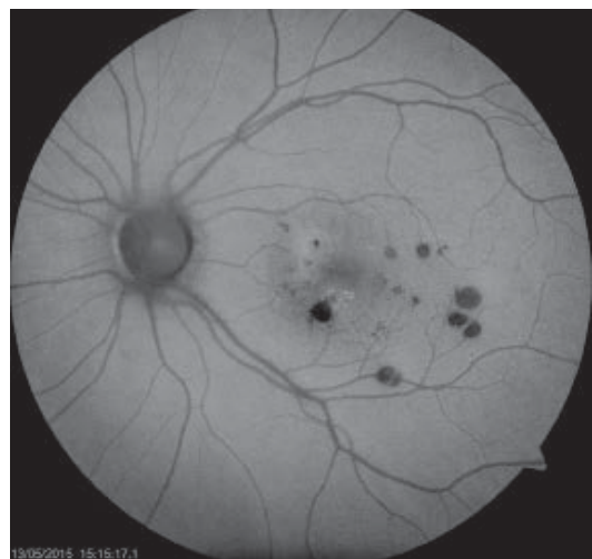
Fig. 6 Auto-fluorescence photograph of ocular fundus of left eye. Deposit of atrophy of RPE