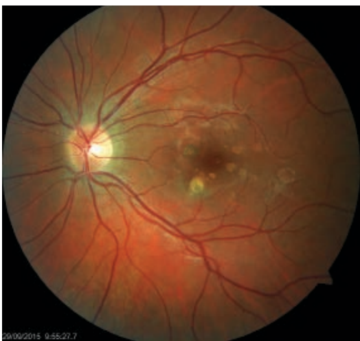
Fig. 5 Left eye. Original active deposit on retina progressively bordering and partially pigmented