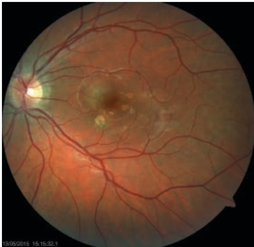
Fig. 1 Left eye. Finding of acute inflammatory deposit in central region of retina