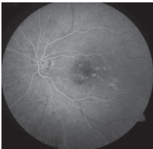
Fig. 3 FAG of left eye. Hyperfluorescence of window defects of RPE in place of inactive inflammatory lesion