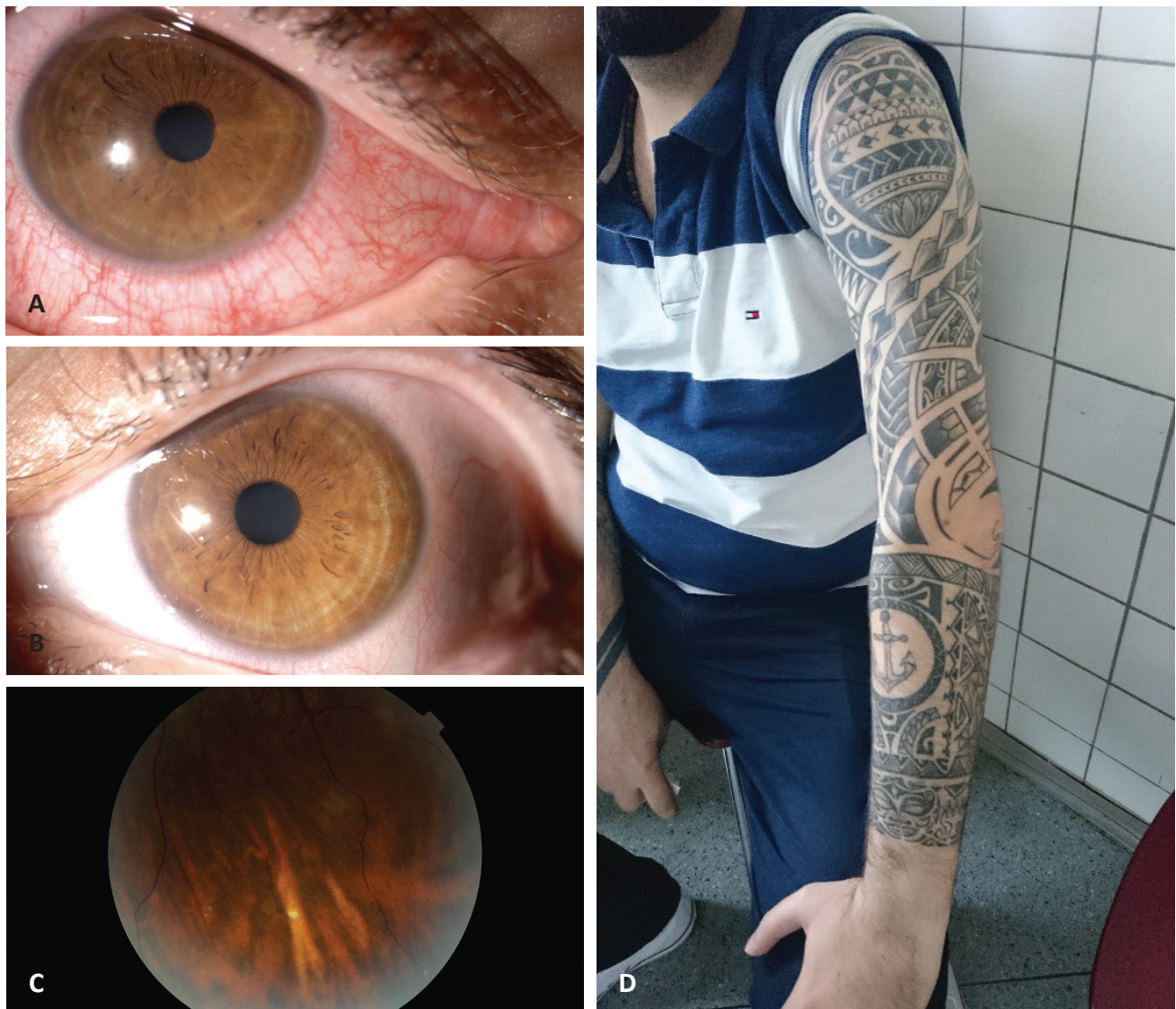
Fig. 2 – Patient no. 2

2a Tattoo of left arm without induration or redness of skin