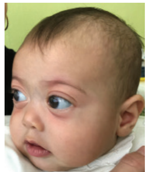
Fig. 2: Central facial dysmorphism, shallow orbits, pseudoexophthalmos, hypertelorism and low root of nose in patient with Marshall/Stickler syndrome at age of 4 months.