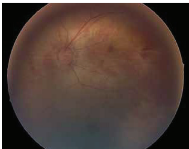
Fig. 4: Ocular fundus in patient with Marshall/Stickler syndrome, right eye. For description see table no. 2.