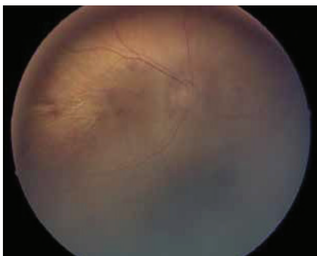
Fig. 5: Ocular fundus in patient with Marshall/Stickler syndrome, left eye. For description see table no. 2.