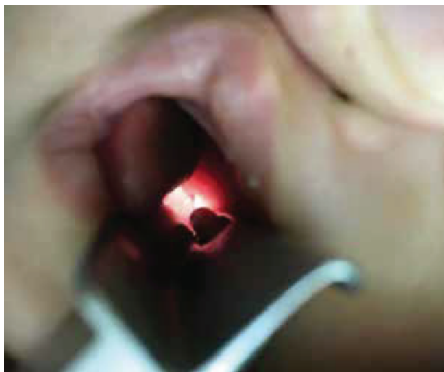
Fig. 3: Bifid uvula in patient with Marshall/Stickler syndrome.