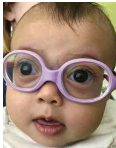
Fig. 6: Central facial dysmorphism, shallow orbits, pseudoexophthalmos, hypertelorism and low root of nose in patient with Marshall/Stickler syndrome at age of 15 months.