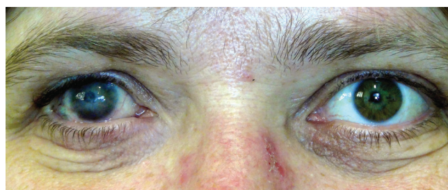
Fig. 8 and 9. Patient no. 4 before and after KTP procedure