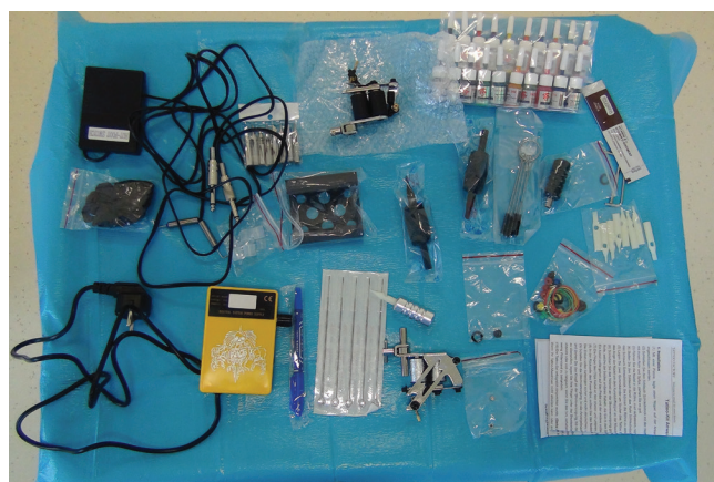
Fig. 1. Tattooing kit and pigments

During a follow-up examination 3 days after the operation, the eyeball was only slightly superficially injected, in