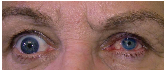
Fig. 4 and 5. Patient 2 before and after KTP procedure