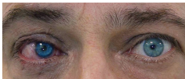
Fig. 6 and 7. Patient no. 3 before and after KTP procedure