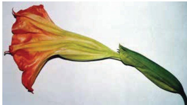
Fig. 2. Goblet-shaped flower of plant Datura suaveolens

in the left eye, there was also no constriction of the pupil. A test with 1.0 Pilocarpine differentiates a neurogenic cause of mydriasis from mydriasis caused by a cholinergic antagonist. If the muscarinic receptors on the affected side are occupied by an anti-cholinergic agent, 1% Pilocarpine leads to weak or no miosis. By contrast, in the case of neurogenic causes of mydriasis, clear constriction of the pupil takes place upon its application (2). In this case therefore the pharmacological test confirmed mydriasis induced by an anti-cholinergic agent. After a number of targeted questions (what was the child doing, where was it playing, with what did she come into contact, for example plants?) we determined contact with the plant Datura suaveolens , known as “Brazil's white angel's trumpet” (Fig. 2). The child broke off and held in her hand a goblet shaped flower of this plant. The medical history of contact with Datura suaveolens , which contains alkaloids such as L-hyoscyamine, atropine and above all scopolamine, therefore corresponded with the objective finding in the child – juice from the flower probably came into contact with only one eye. The child's agitation and reddening of the cheeks could also have been a symptom of mild general intoxication. Spontaneous correction ad integrum took place without therapy within 24 hours (Fig. 3).