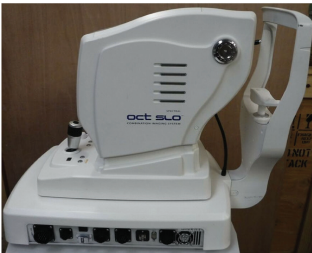
Fig. 1. Special Optical Coherence Tomography instrument

According to certain studies (5), in the case of spectral domain OCT it is possible to attain sensitivity of as high as 96% and specificity of 76%. The aim of our retrospective study was to evaluate data obtained thanks to RNFL analysis in 4 observed summary quadrants and compare it with the resulting diagnosis of glaucoma neuropathy determined subsequently primarily on the basis of changes in the visual field. A specific feature of our study is the categorisation (0-