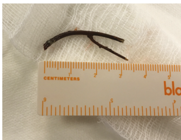
Fig. 4b. Extracted twig from anterior part of orbit

whether the eyeball and optic nerve are damaged or threatened. Penetrating injury of the eyeball must be unequivocally excluded. If the patient's condition so allows, we must examine visual acuity and the ocular fundus.