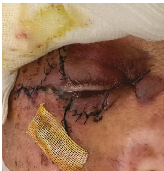
Fig. 6b. Finding at follow-up examination on the first day after reconstruction