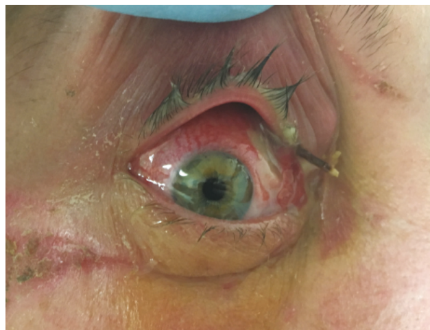
Fig. 4a. Patient with foreign body in orbit. The cause was a fall in the forest, the eyeball was not damaged

In all patients it is of key importance to determine the mechanism of injury. The basis is therefore a carefully recorded medical history. From a general perspective it is necessary to exclude the threat to vital functions, from an ophthalmological perspective it is a priority to determine