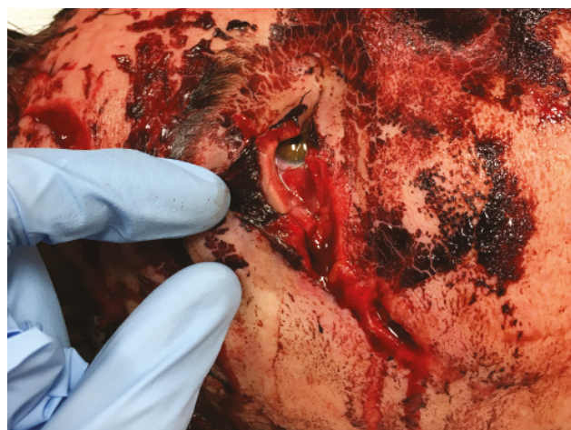
Fig. 3a. Open wound of outer corner, including torn lower canthal ligament. Patient after traffic accident