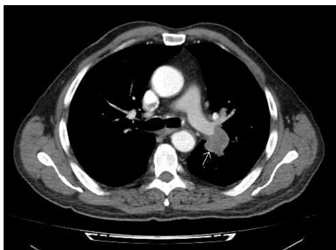
Figure 2. Lymph node in the hilar area 30*24mm (marked with a white arrow)

chronic disease, other than hypertension, and he was a smoker.