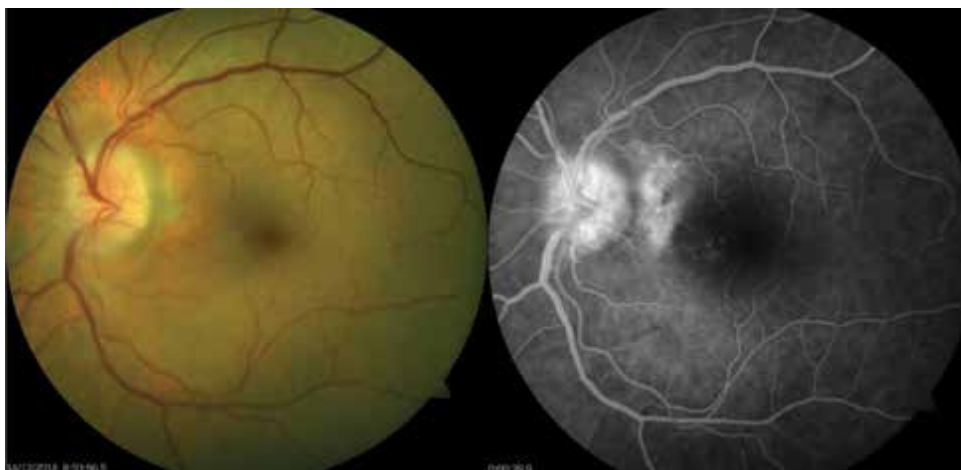
Figure 1. Swelling in the left optic disc in the fundus photo (left image). Hyperfluorescence appearance at the head of the optic disc in the left eye in fundus fluorescein angiography (right image)