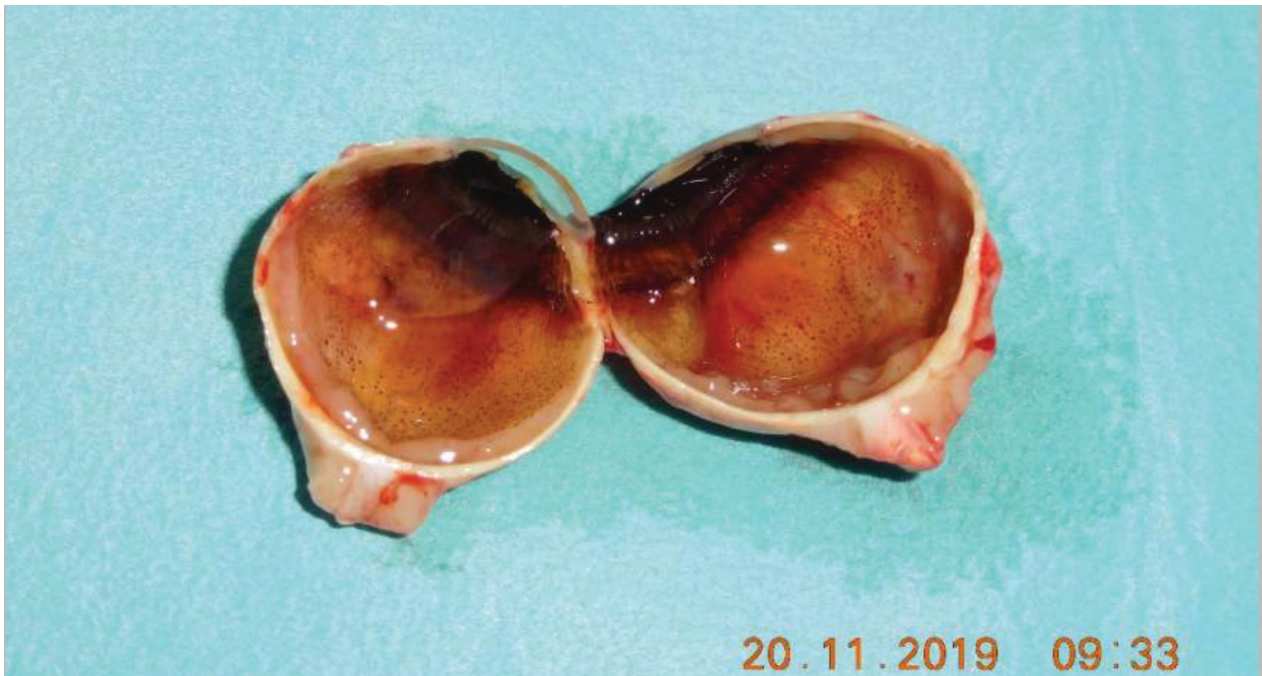
Figure 2. Bulbus after the enucleation: intraocular mass 2x1cm with circular overgrowing around the optic nerve

wall of the bulbus under the choroid was described as a solid infiltration of small lymphocytes, with a round or slightly folded nuclear membrane, lumpy chromatin, central nucleus, small amount of cytoplasm, with formation of germ / proliferative centres; mitotic activity was low. The same infiltration was in the retrobulbar tissue around the optic nerve.