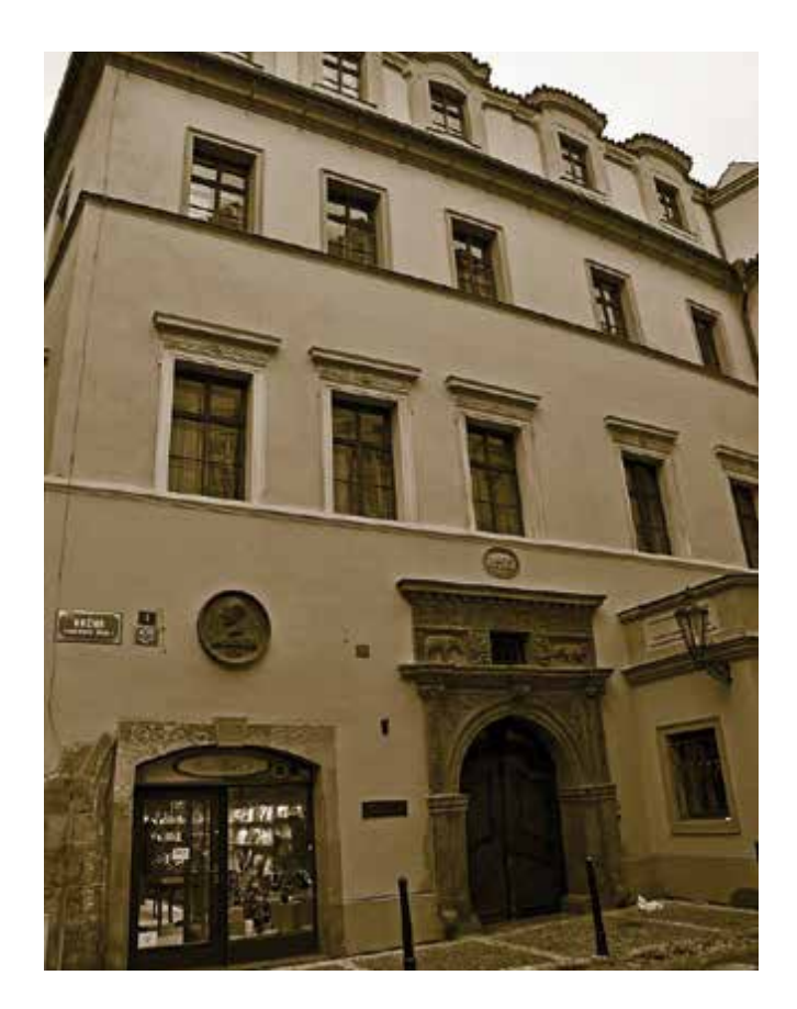
Figure 5. Schwefel Gasse no. 475, today Melantrichova Street no. 16

From 1844 to 1847, he lived in the centre of Prague (near the Old Town Square), at Schwefelgasse no. 475/I. Since 1894, it has been called Melantrichova Street (no. 16). Above the entrance are sculptures of two golden bears. That is why the house is called "House at the Two Golden Bears" (Dům u Dvou Zlatých Medvědů). It is a large Renaissance building, one of the oldest buildings in Prague, built in 1559–1567 on the site of two Gothic houses. The building was reconstructed in 1975–1980 [21–23] (Figure 5). In 1846, his teacher J. N. Fischer lived in Prague's New Town at Heinrichsgasse no. 889 on the ground floor (today Jindřišská 17) [24].