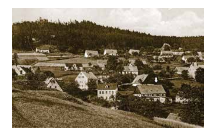
Figure 2. Birthplace of Ferdinand von Arlt in Obergraupen (Horní Krupka), early 20th century (arrow)

by Prince Johann von Clary und Aldringen (1753–1826) [1]. The school was in the centre of the village next to St. Valentine's Church. Today, on that site at the address Vrchoslavská 2/3, is a three-story residential building. He attended grammar school from 1825 in Leitmeritz (today Litoměřice) in Jesuitengasse, which was located next to the Episcopal Priestly Seminary (former Jesuit residence). In Litoměřice he had accommodation at the grammar school (alumnat) [2]. Today this is Jesuit Street no. 18 and 20, and the former seminary was at no. 22.