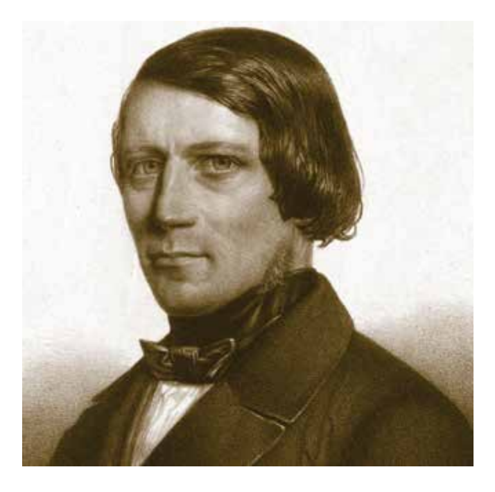
Figure 1. Ferdinand von Arlt (1812–1887) at the age of about 40 (Lithograph by Moritz Golde, printed in the studio of Franz Hanfstaengl in Dresden)