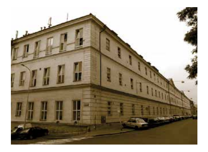
Figure 3. Eye Clinic was located on the second floor in the east wing of the general hospital in Prague (today U Nemocnice 2)

Von Arlt was the first to give an accurate description of trachoma (1855) and was the first to understand the essence of the pathogenesis of myopia (1854), arguing