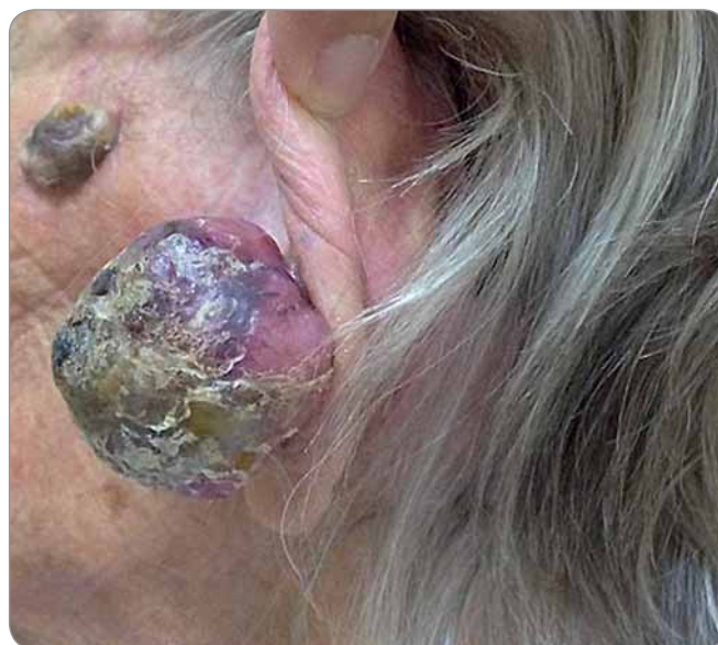
Fig. 2. A solitary erythematous nodule with prominent vessels, hyperkeratotic and ulcerated surface on the left ear lobe (side view).