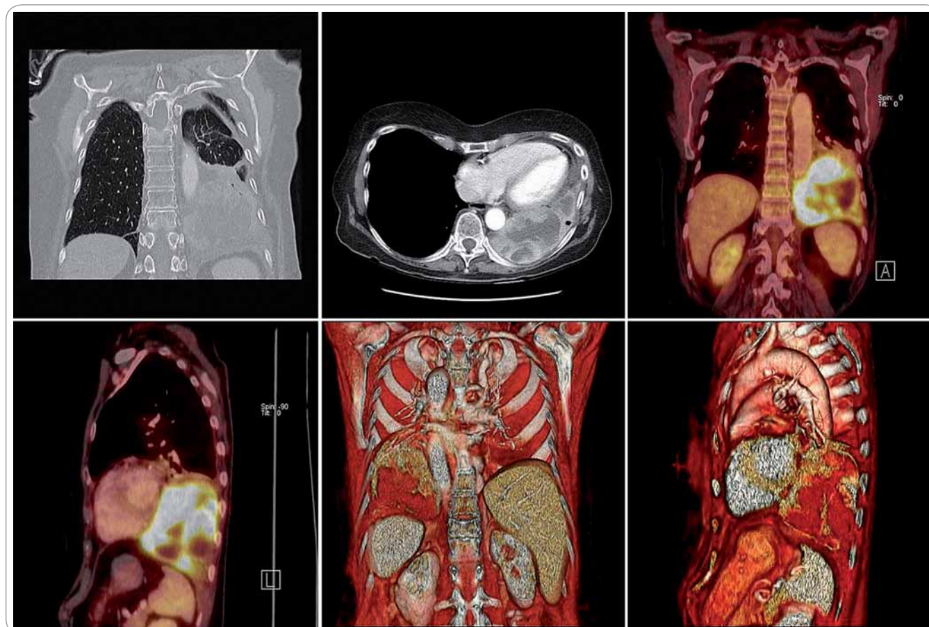
Fig. 1. CT images of the tumor before the surgery. The tumor arises from the lower left lung lobe and invades the diaphragm.

The histogenesis of SARC remained unclear for a long time due to its histo-