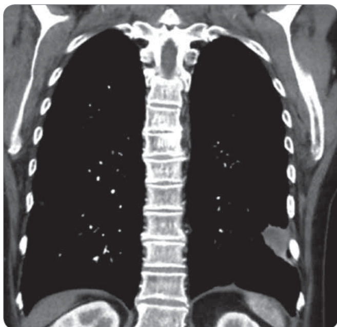
Fig. 3. Control CT of lung and mediastinum – progression of tumor (6/2014).