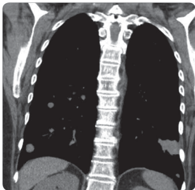
Fig. 1. Input CT of lung and mediastinum (8/2013).

Rare mutations are described in the literature, approximately in 10%