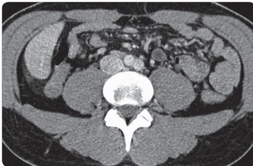
Fig. 1. Axial CT of pathologic para-aortic lymph nodes.

Past medical history is noteworthy for right cryptorchidectomy in two years of age. The patient underwent right orchifuniclectomy with a placement of a testicular prosthesis and extirpation of the left testis nodule. The histo-pathological examination revealed bilateral seminoma; the right tumor mass measuring 2.5 cm in diameter, with peritumoral vascular and lymphatic vessel invasion. The left nodule was 0.3 cm in diameter. The staging CT scan showed lymphadenopathy within the para-aortic and the right com-