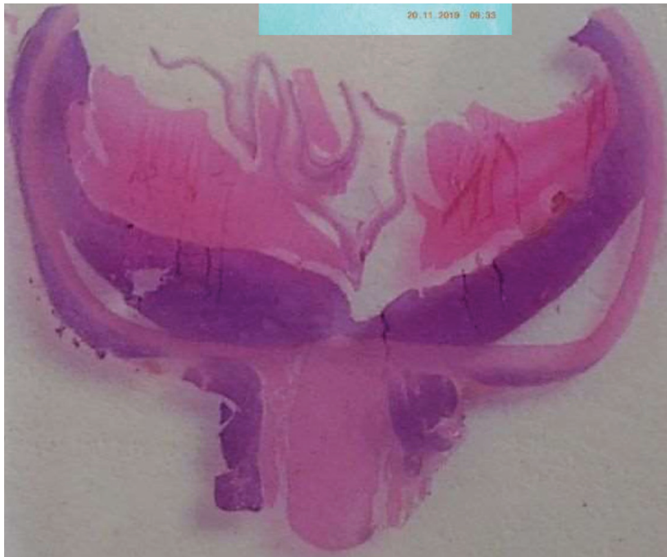
Figure 3. Histological finding: the tumour on the posterior wall of the bulbus under the choroidea and a retrobulbar infiltration around the optic nerve

enucleation, the haematologist-oncologist indicated a positron emission tomography examination with computed tomography, which was negative for lymphoma disease. Ophthalmological examinations are performed at half-yearly intervals, with simultaneous monitoring of the right eye for possible development of bilateral lymphoma. The right eye remains without signs of lymphoma. Intraocular localisation of lymphoma with retrobulbar infiltration around the optic nerve remains the only detected localisation of primary intraocular lymphoma. Enucleation was used as a diagnostic as well as a treatment modality.