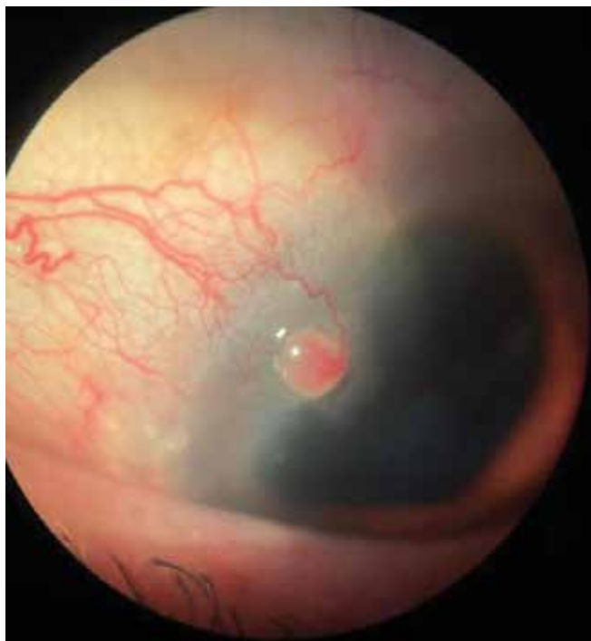
Figure 1. Salmon pink nodule with smooth surface and feeder vessels from the nearby conjunctiva on the supratemporal region of the cornea after cataract surgery

sion, with superficial feeder vessels originating from the adjacent conjunctiva toward the lesion. In addition, the underlying cornea was slightly edematous without any obvious epithelial defects on fluorescein staining (Figure 1). The remaining examinations of the same eye including the palpebral conjunctiva and fornices revealed no further pathologies and the examination of the other eye was normal.