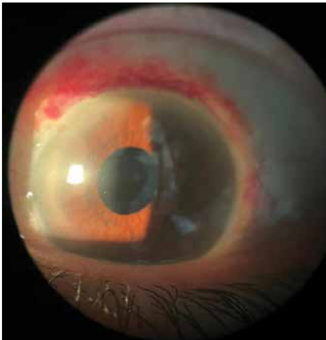
Figure 4. Post-operative view of the corneal surface after excisional biopsy

infiltration and thick bundles of collagen fibers throughout the stroma. Furthermore, the top of the lesion was not covered with the epithelium and was replaced by a fibrino-leukocytic exudate and, on investigation of the base of the lesion, no corneal intraepithelial neoplastic cells in favor of CIN could be detected (Figure 2). These histopathological findings along with the macroscopic appearance of the lesion were more in favor of chronic or late-stage of a non-lobular type of pyogenic granuloma or granulation tissue. Therefore, we also performed anti-CD34 immunohistochemical staining to determine the vascularity of the lesion (Figure 3).