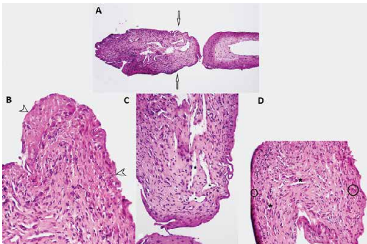
Figure 2. Microscopic examination of the excised lesion with Hematoxylin and Eosin staining shows superficial corneal tissue attached to an elevated lesion (A) [arrows], with loss of superficial epithelium which was replaced by fibrino-leukocytic exudate (B) [arrowheads]. underlying connective tissue stroma was fibrous and revealed numerous endothelial cell lined capillaries (stars) with perivascular inflammatory infiltration (circles) and thick bundles of collagen fibers throughout the stroma (C, D)

Histopathological examination of the lesion revealed an inflammatory tissue, containing numerous endothelial cell-lined capillaries with perivascular inflammatory