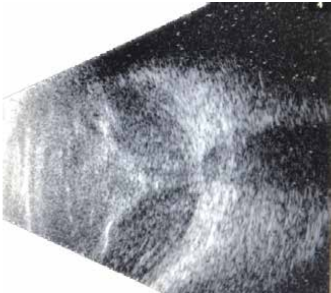
Figure 1. B-scan demonstrated a near-kissing suprachoroidal hemorrhage

the right eye was deep with an open angle. His intraocular pressure (IOP) was 68 mmHg over the left eye and 19 mmHg over the right eye. Fundus examination revealed suprachoroidal hemorrhage and was confirmed with an ultrasound scan (B scan) of the left eye, which demonstrated a near-kissing suprachoroidal hemorrhage (Figure 1). His blood pressure (BP) was 196/106 mmHg. His complete blood count and coagulation test were normal. He was admitted; thus, oral Acetazolamide 250 mg four times daily and syrup glycerol (1 g/kg body weight) thrice daily was commenced. Locally Gutt Timolol twice daily, Gutt Latanoprost at night, Gutt Dorzolamide thrice daily, and Gutt Brimonidine thrice daily were given to control his eye pressure. Two antihypertension medications were also started to control his blood pressure. Despite maximum medical therapy, his intraocular pressure was persistently high. He underwent left eye suprachoroidal drainage surgery, which subsequently managed to maintain his intraocular pressure. Unfortunately, his vision remained poor postoperatively, despite surgery, good IOP and BP control.