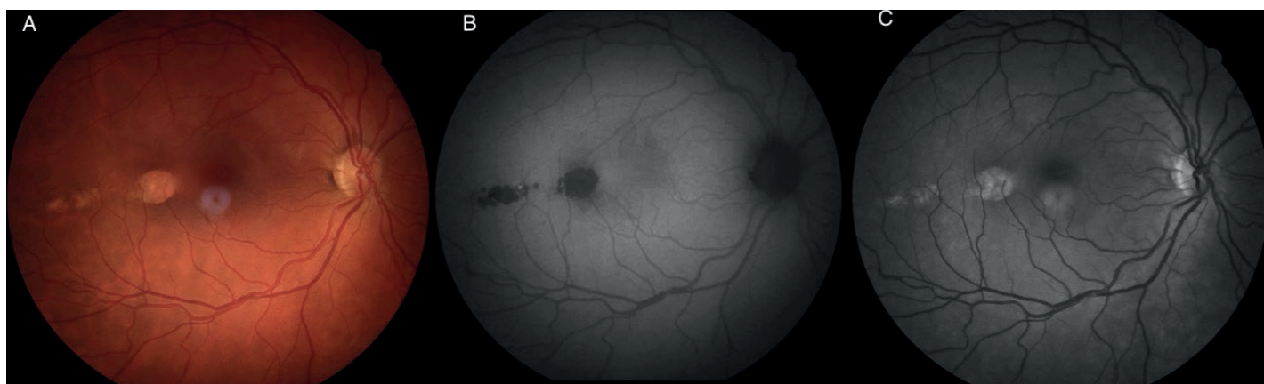
Figure 1. Fundus photo (A) of the right eye with torpedo maculopathy, fundus autofluorescence (B) shows areas of hypofluorescence in the place of the main and satellite lesions, the red free image (C) highlighted the lesion

Torpedo maculopathy is a rare, benign retinal lesion. The typical finding is a unilateral hypopigmented lesion temporally from the fovea, with the tip directed towards the foveola [5]. Atypical forms of TM have also been described in the literature, as a bilateral finding, two torpedo-shaped lesions in one eye, a hyperpigmented TM lesion or a case of inferior TM with the tip oriented towards the optic nerve papilla [8,10]. TM is described as a solitary lesion, but satellite lesions may also appear, located in a single line with the primary lesion. All satellite lesions described to date are smaller and localized temporally [11]. TM is usually a chance finding in asymptomatic patients, it is of a non-progre-